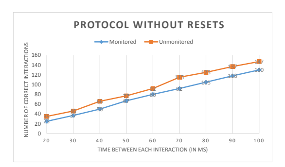
Figure 5: Protocol with accumulating delays c (left) and maximum number of correct interactions (right)

Scenario 1 We have initially considered a protocol with the same structure of the protocol in Figure 2 but with the constants in the clock constraints decreased by a scale of 100. We have changed the constraints to test transparency in a less optimistic scenario, with smaller difference between delays and monitor overhead (evidently transparency would also hold with larger differences, e.g., when using the constraints in Figure 2). We used the implementation in Figure 3 with delays updated to match the protocol, as shown in Figure 5 (left). The outcome is presented in Figure 5 (right). The graph illustrates the time for completing a protocol for increasing number of recursive executions.